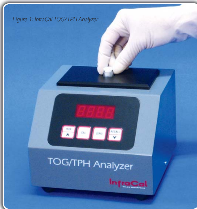
Figure 1: InfraCal TOG/TPH Analyzer

Differences begin with sample collection. It is very difficult to get two identical grab samples from a waste stream as it is typically not well amalgamated. Another consideration is recognizing the inherent error in the EPA 1664 Method itself. As stated in the method in section 17.0 "Acceptance Criteria for Performance Tests" for ongoing precision and recovery, the accepted range hexane for extractable material is 78-132%. This means that for a 100ppm